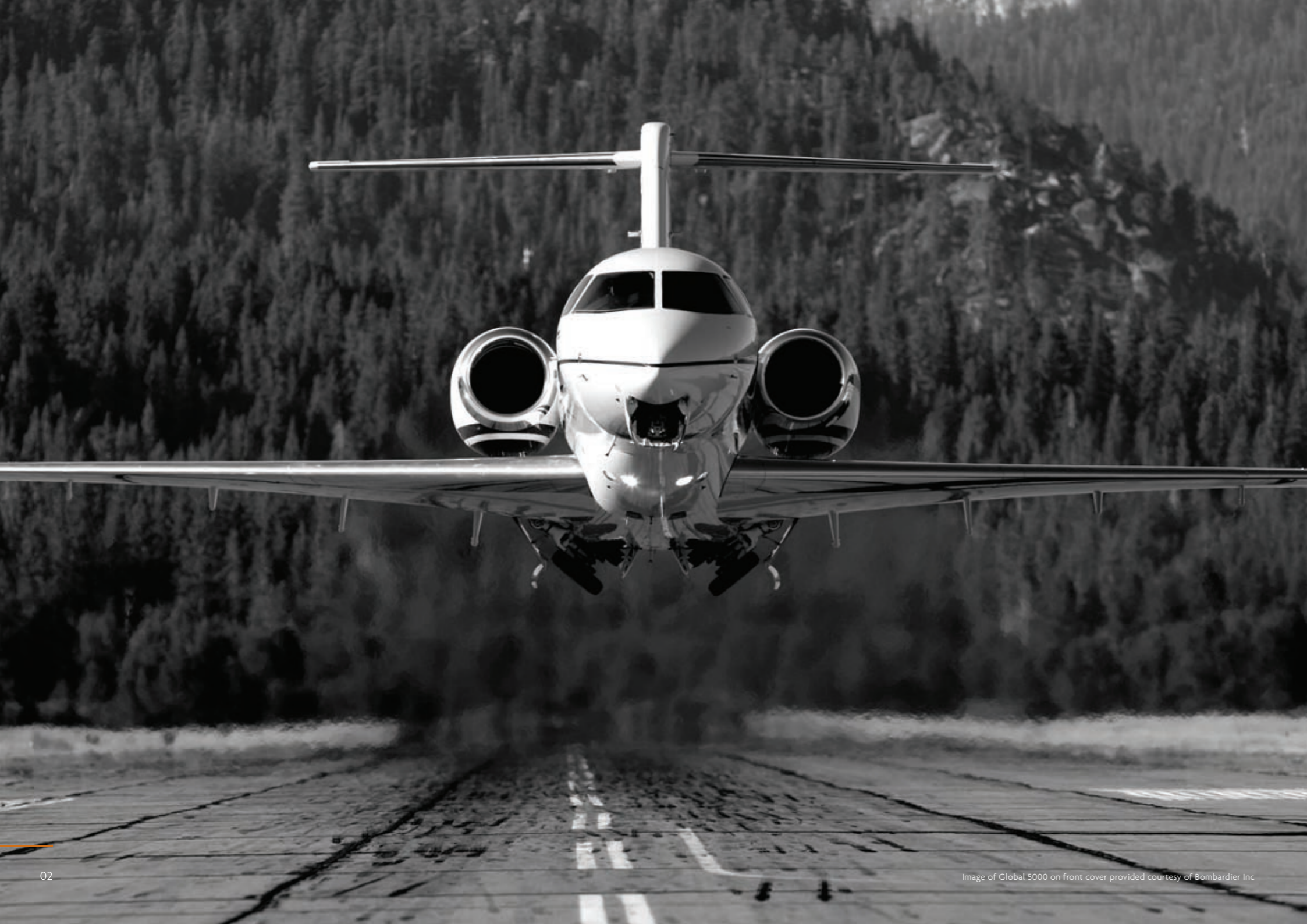
Image of Global 5000 on front cover